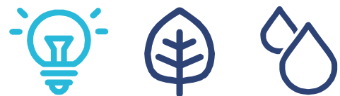
Drying energy consumption (kWh/ton)

Paper grade: Tissue Kitchen towel & Toilet