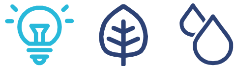
Drying energy consumption (kWh/ton)

Paper grade: Tissue Kitchen towel & Toilet