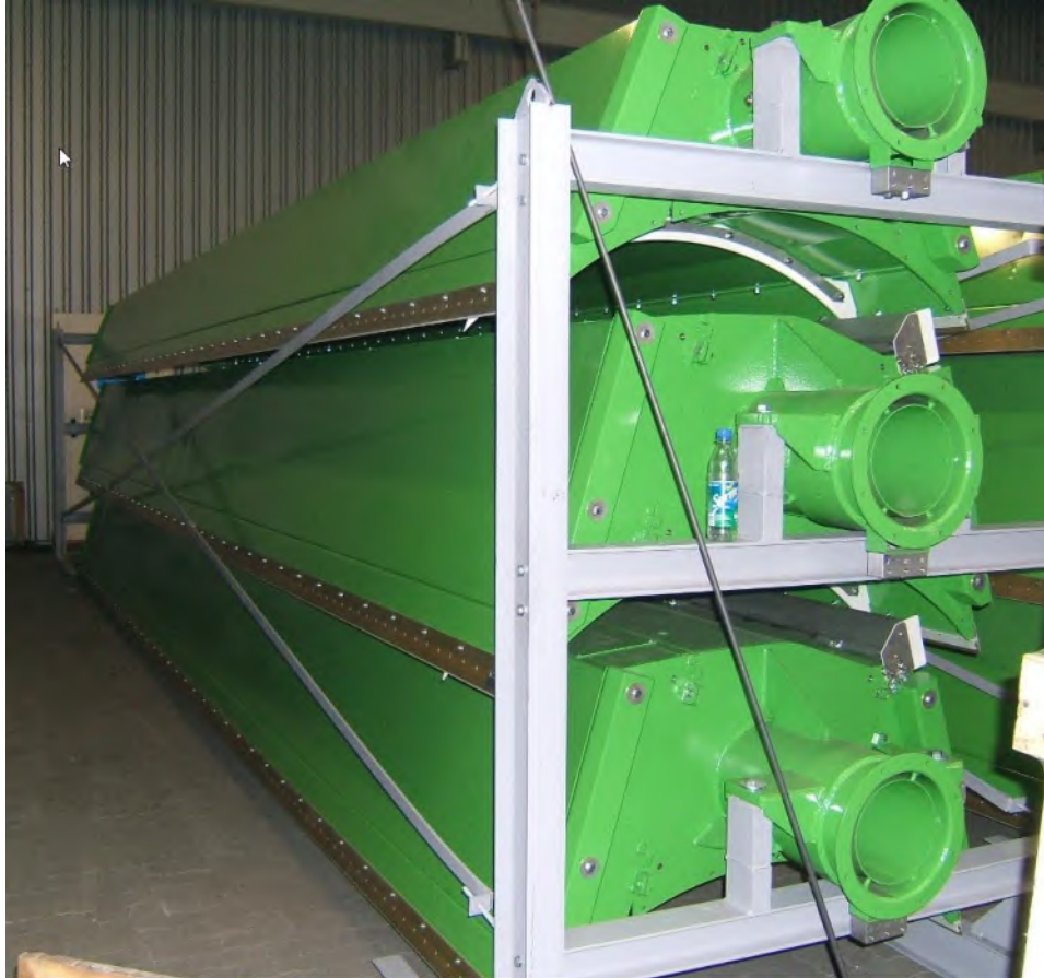
Figure 1: Packaging in steel frame for transport to the customer. The quantity and weight to be packed is specified by the design department on the basis of provided device drawing e.g. 1323-018194 (WI)